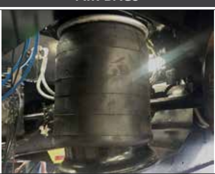
30K pound rated large diameter air bags are standard. This allows for lower operating pressure and higher capacity when needed.