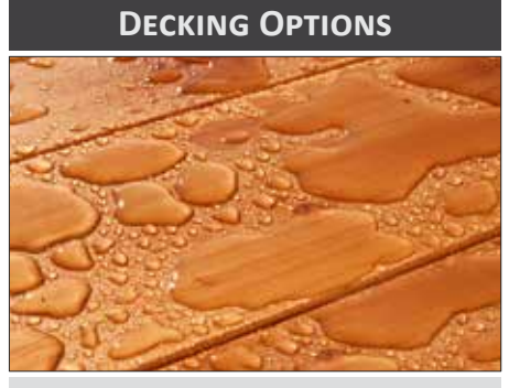
Oak: Standard. Apitong: Best strength to weight ratios of natural woods. Rumber: Composite which is impervious to fluids, mud, oil and UV rays.

All Lighting is LED and mounted in rubber grommets to DOT standards.